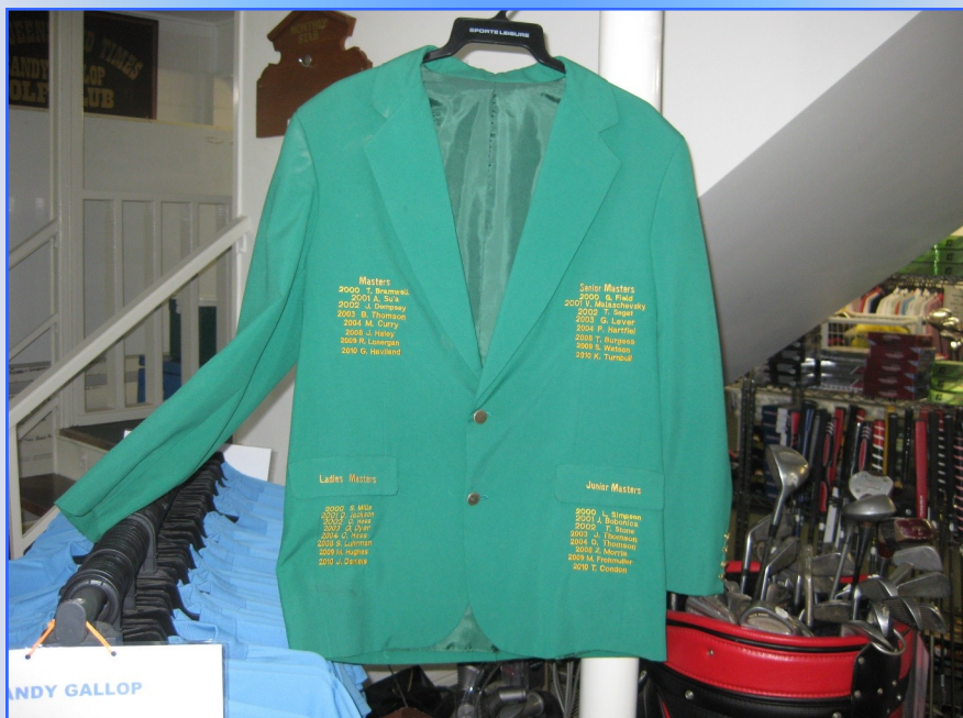
“The Masters Jacket”